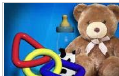
Mom Arrested After Baby Left in Van