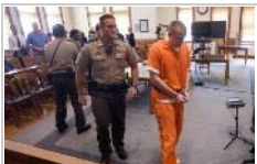
Convicted Killer Sentenced to 50 Years in Prison