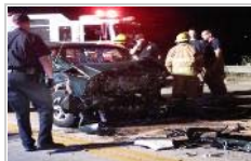
Head-on Crash Leaves Cedar Rapids Man in Critical ...