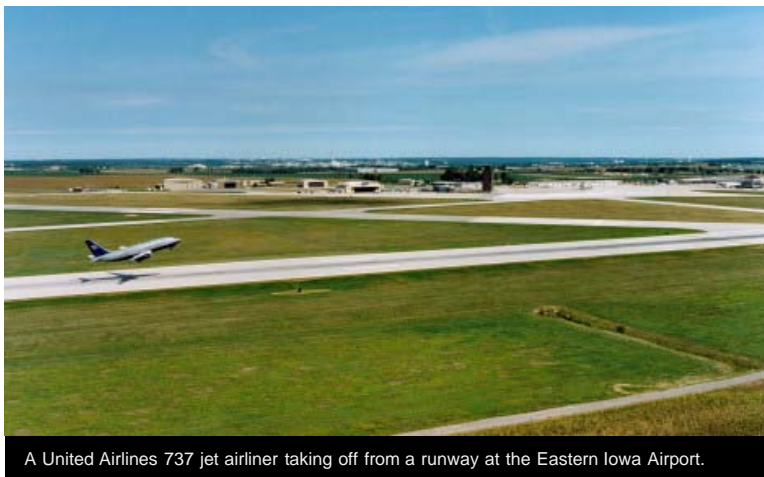
A United Airlines 737 jet airliner taking off from a runway at the Eastern Iowa Airport.